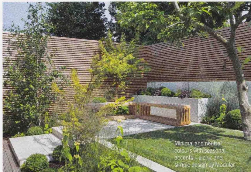
Minimal and neutral colours with seasonal accents - a chic and simple design by Modular

This practice focuses all of its attention