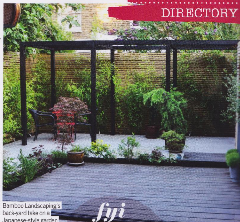
Bamboo Landscaping's back-yard take on a Japanese-style garden

Looking for an inspired way to transform your basement, balcony, rooftop or front or back garden? Call in this qualified, experienced and insured outfit. Winner of both an RHS gold medal and a Young Garden Designer of the Year award, it can suggest and execute planting schemes