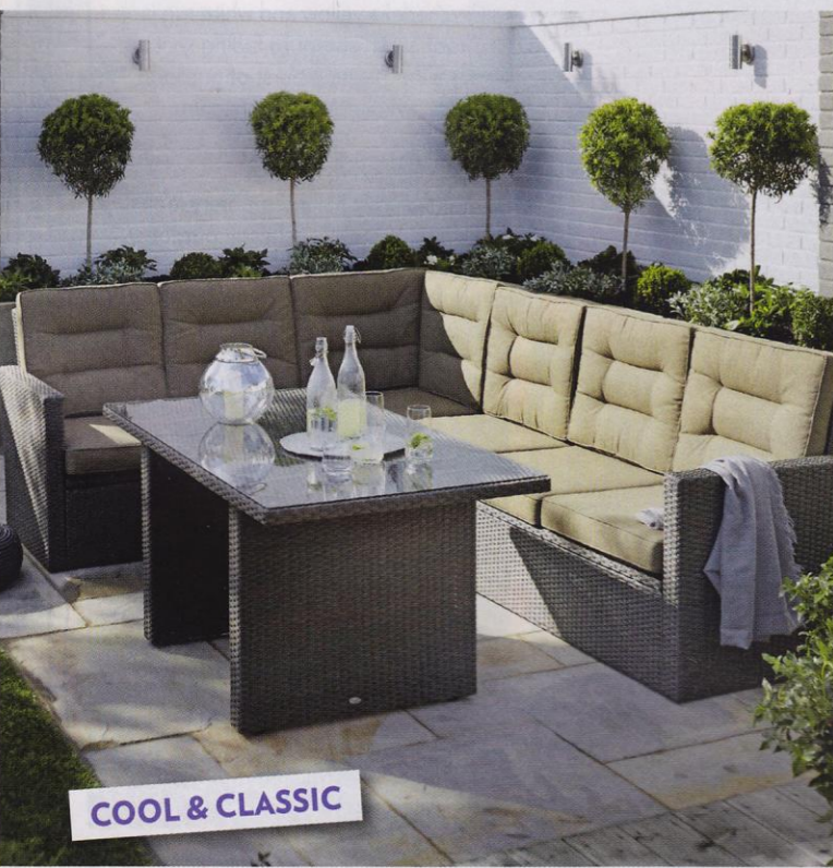
COOL & CLASSIC